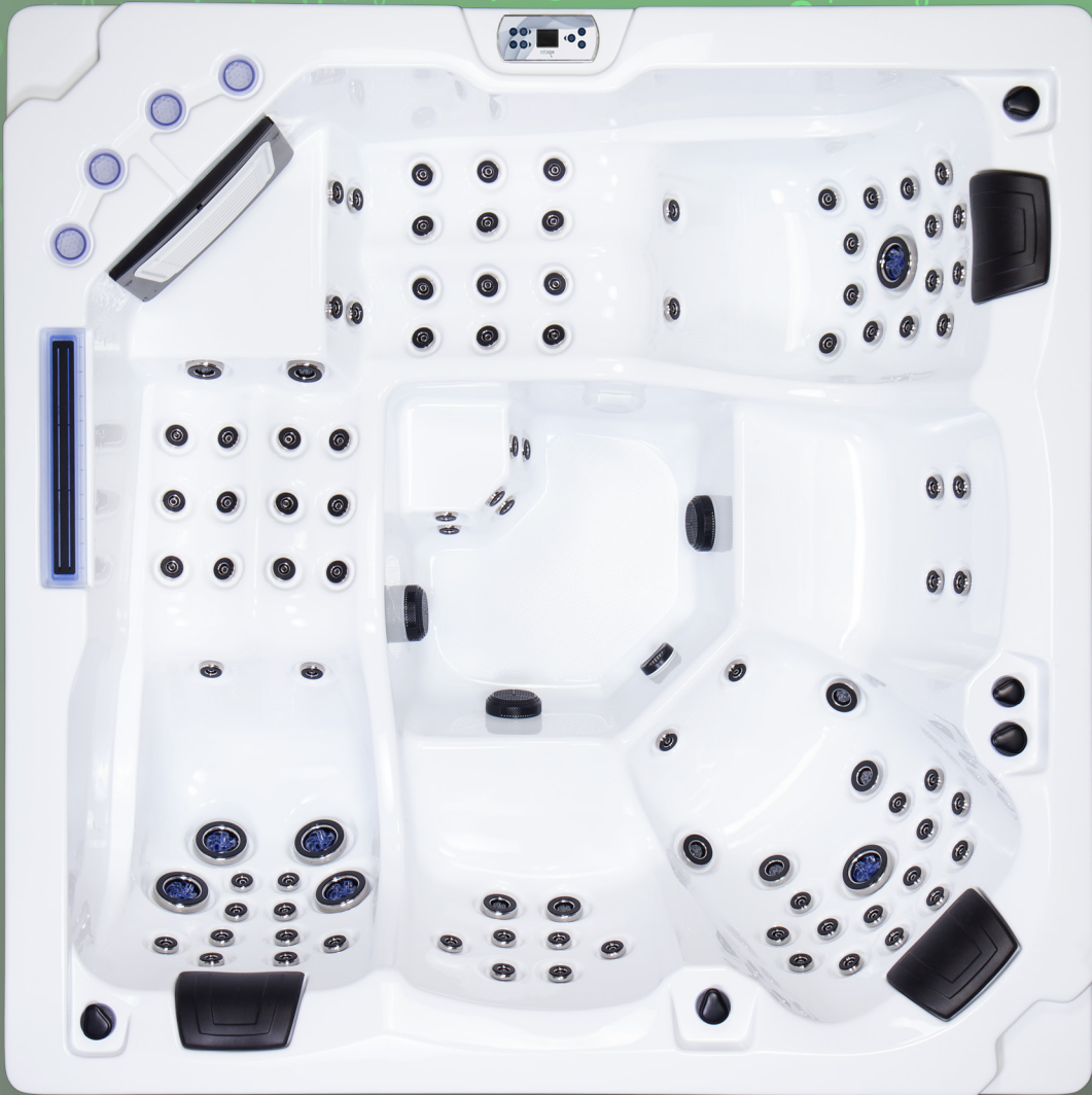
Matrix Deluxe Edition